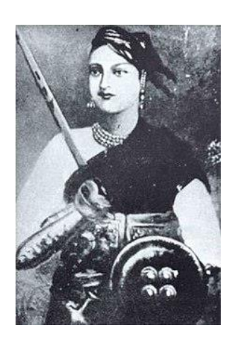
19 Nov 1828- 18 June 1858 Reference