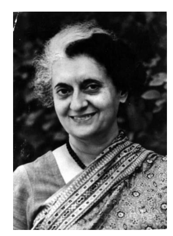
(19 Nov 1917 -31 Oct 1984) Reference